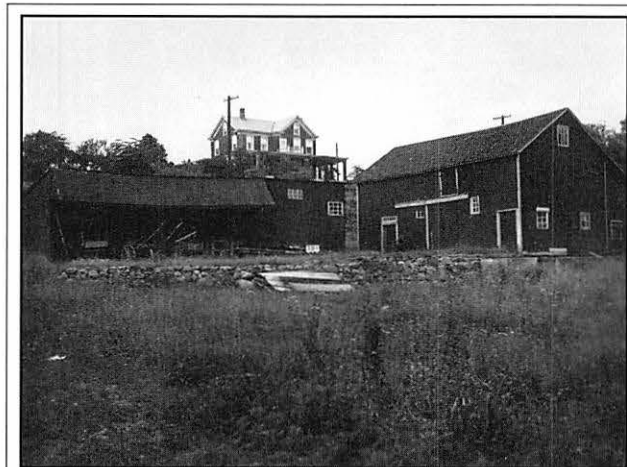
The William Wilson farmhouse and barns and sheds, east of East Crescent Avenue, in a photograph taken in 1940.