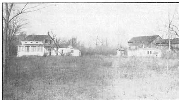
The Christopher House at 330 Hillside Avenue Allendale, part built possibly as early as the 1780s. Above, the side of the house facing south, in a photograph taken in 1925. Below, the north side of the house in a photograph taken about 1910. In the early 1900s the McNelley family lived in the house.