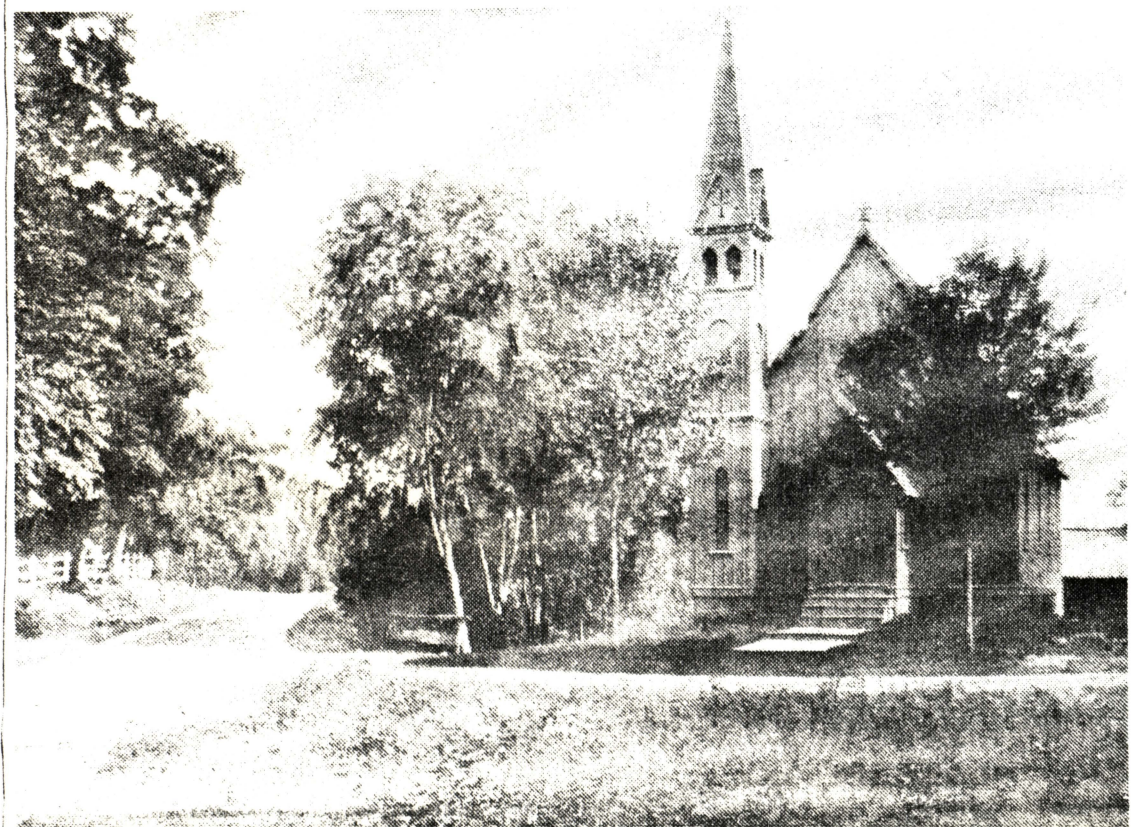
IN THE 1880's, THIS WAS THE CORNER of Franklin Turnpike (left) and Cottage Place. The building was the Episcopal Epiphany Church, later moved to East Orchard Street and Franklin Turnpike.

THE FIRST EPIPHANY CHURCH in Allendale was located at the corner of Franklin Turnpike and Cottage Place. The Parish House was built after the Church was moved to Franklin Turnpike and Orchard Street.