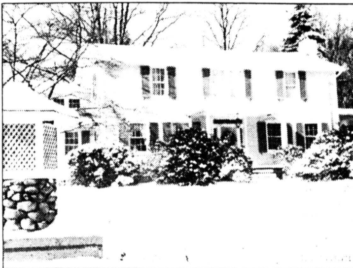
Homes at 723 West Crescent Ave., left, and 794 West Crescent Ave., right, reflect the farmhouse influence on local architecture.