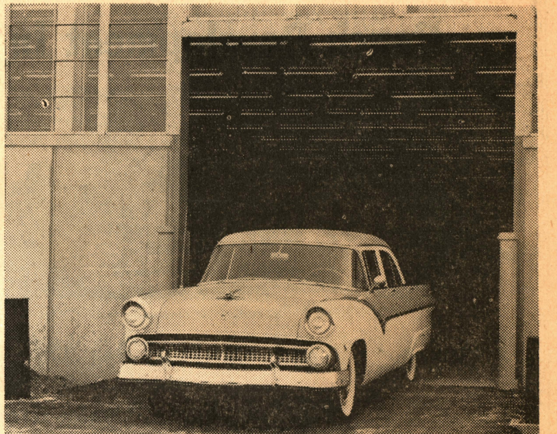
OUT THIS DOOR WILL COME THE NEW CARS—When each and every job on the assembly line is finished the new Fords will exit from here to undergo final testing and inspection. The company says that in two-shift production the plant will be capable of turning out almost 1,100 cars and trucks a day.

COTTAGE & APARTMENTS On 50-acre Estate. References Exchanged Suitable for Two People FRANK FILOR Garnerville, N. Y. HA 9-5906