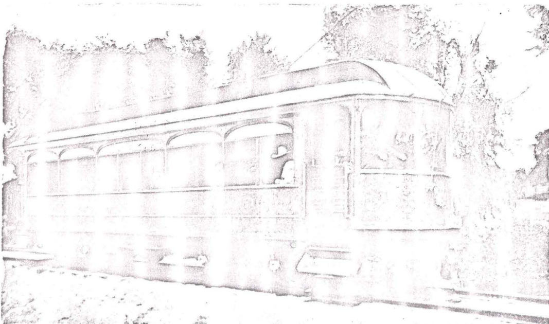
Allendale's First Trolley, Allendale, N. J.

The building was later moved further along the turnpike and finally razed some years ago.